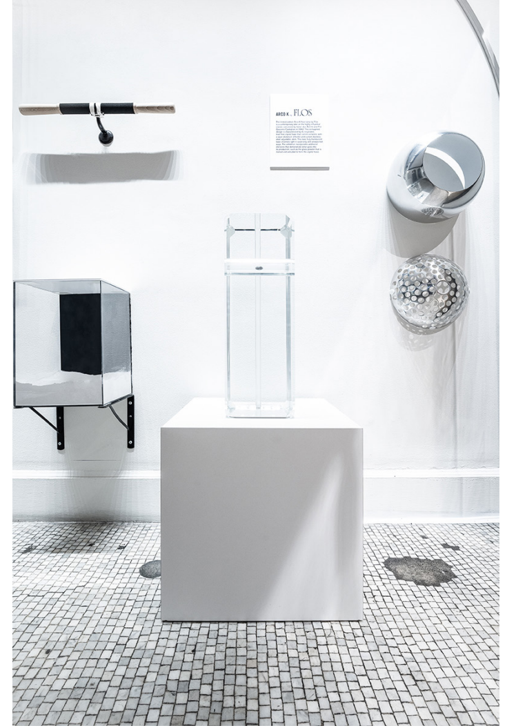
The exhibit gives viewers a look at the key elements found in products, like components of FLOS light fixtures.